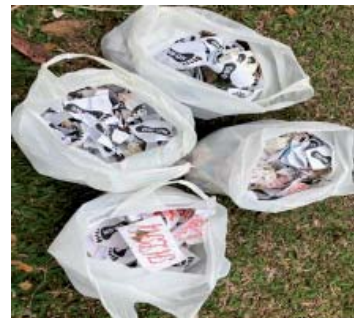
Kudos to true Hashers cleaning up after a run at Pantai Hill Park