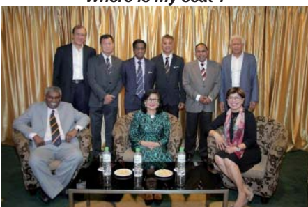
Organisers with the guest of honour