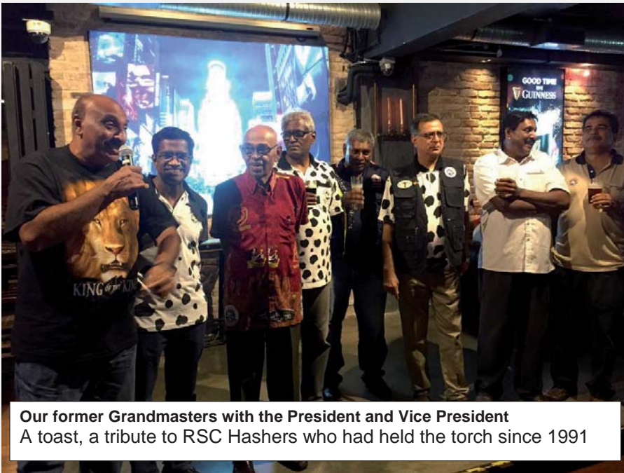
Our former Grandmasters with the President and Vice President A toast, a tribute to RSC Hashers who had held the torch since 1991