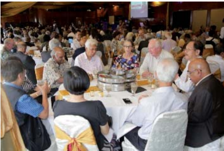
Anxious – what is she going to say