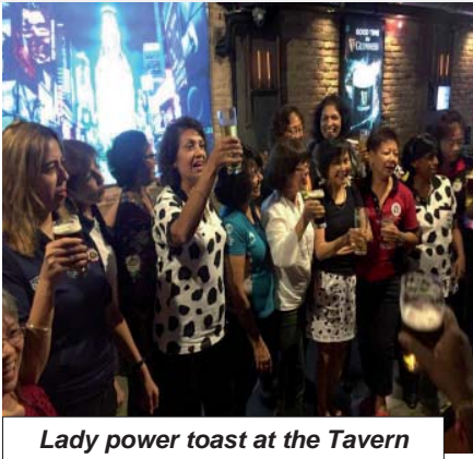
Lady power toast at the Tavern

We thank the General Committee for the arrangement.