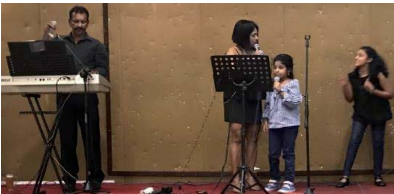
The band and guest artists in action to entertain the crowd.