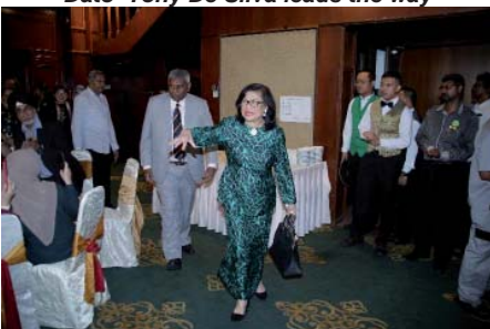
Where is my seat ?