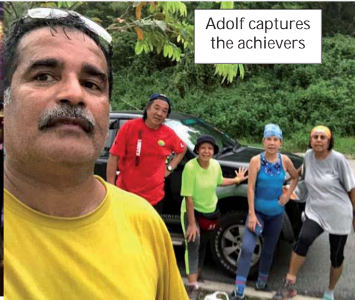
Adolf captures the achievers