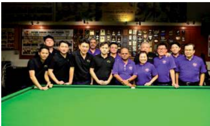
RBSB Polo Club vs Royal Selangor Club

One rose among the thorns ! Six clubs' Convenors