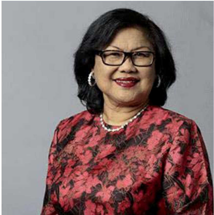
Tan Sri Rafidah Aziz held the male majority attendees spellbound