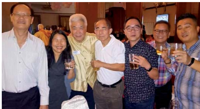
Toast to the merry faces of the evening