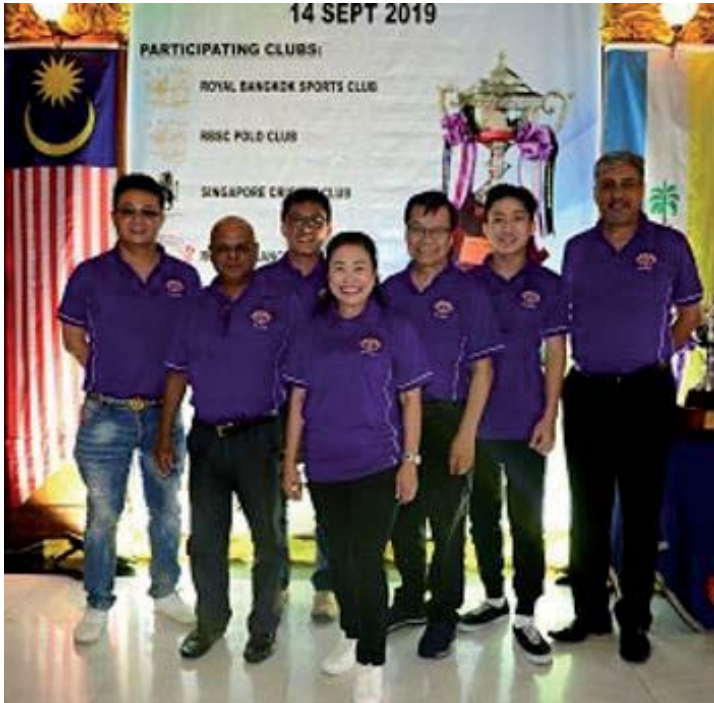
Royal Selangor Club Team

This year's host for the Tri Nation 6-Reds was the Penang Sports Club.