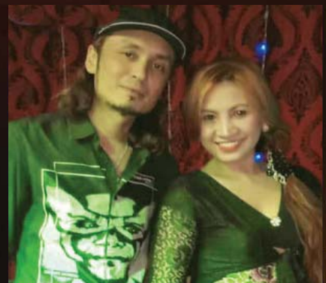
Friday Staneco Band

Live Music starts at 9.00pm till 12.00am