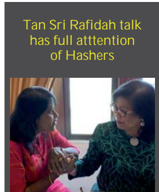
Tan Sri Rafidah talk has full attention of Hashers