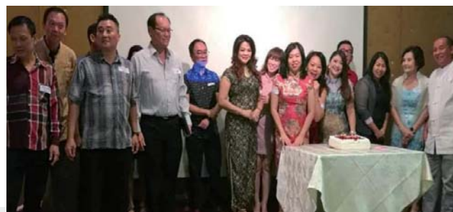
Waiting for the guest of honour Dancing all night