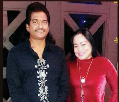
Friday Spellbound Band

Live Music starts at 9.00pm till 12.00am