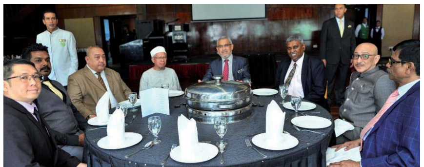
The Minister liked the mutton rendang minang