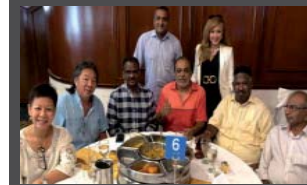
Minds and appetite nourished at the luncheon event