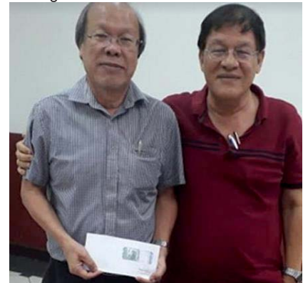
The two dragons ..play hard but good friends