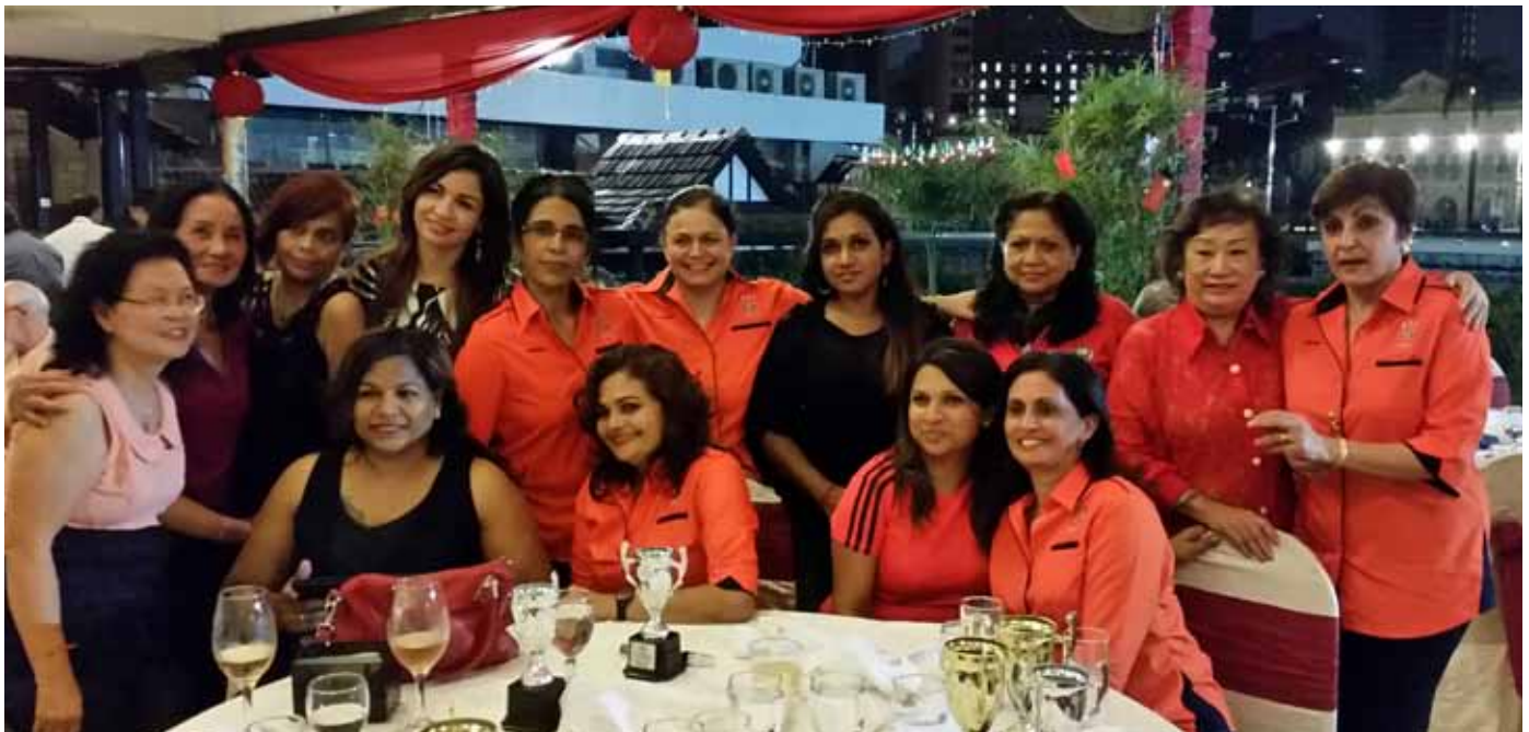
RSC Annual Darts Championship Participants – Ladies team