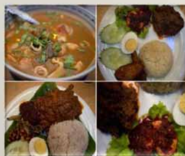
UMI CORNER, MALAY FOOD STALL FOOD COURT, (DATARAN) 12.00 noon to 10.00pm (Mon-Fri)