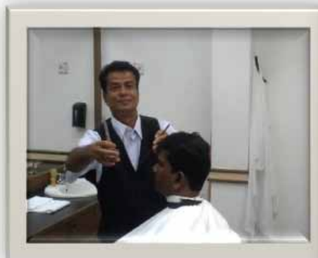
BARBER SHOP (DATARAN) 11.00am to 8.00pm (Mon – Sat)