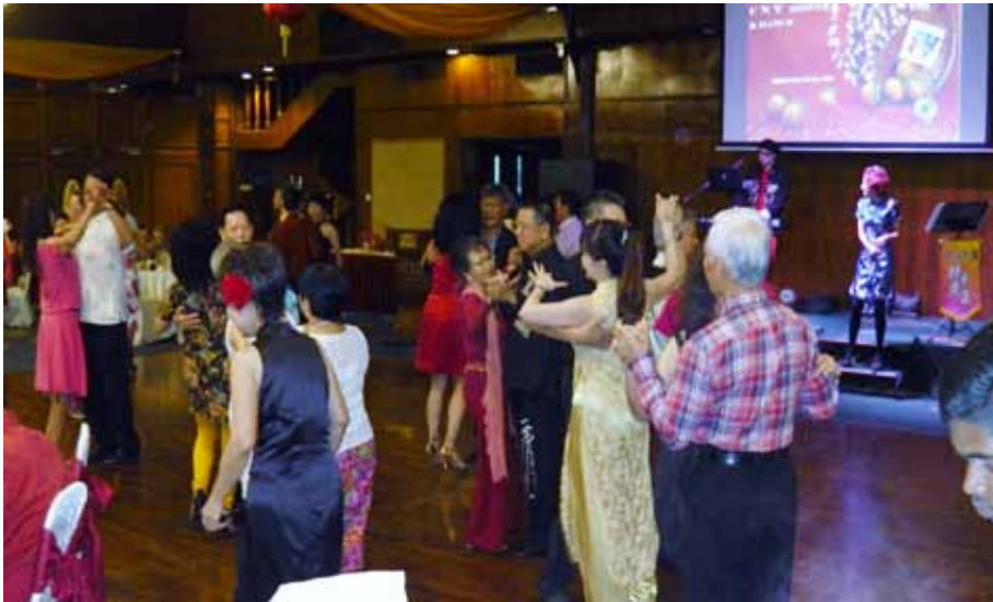
Ballroom Dancing CNY

In conclusion I would like to put on record, a word of thanks and appreciation to the present Dancesport Committee for their relentless effort and hard work. I would also like to extend my best wishes to the next committee for all their future undertaking.