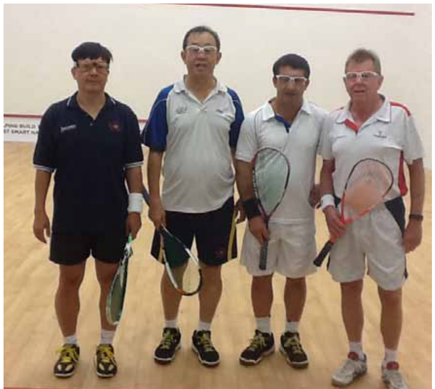
RSC V1 in the finals against the seasoned pair of Tanglin Club.

The RSC Squash Section has always committed to participating at the highest level where HONOUR and GLORY for Royal Selangor Club is the Priority!