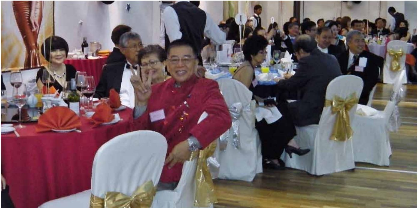
Tripartite at Penang Swimming Club

T he much talked-about Tripartite Event in The Penang Swimming-Club was a successful outing for Dancesport Section RSC on 18th October 2014. Singapore Recreation Club will be the next host for the event, followed by RSC in 2016.