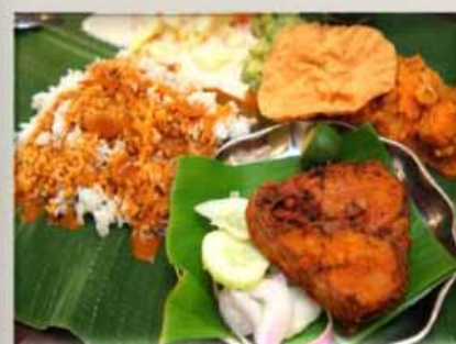
FAMILY SUNDAY CURRY LUNCH FOOD COURT, (DATARAN) 11.00am to 3.00pm (Sundays)